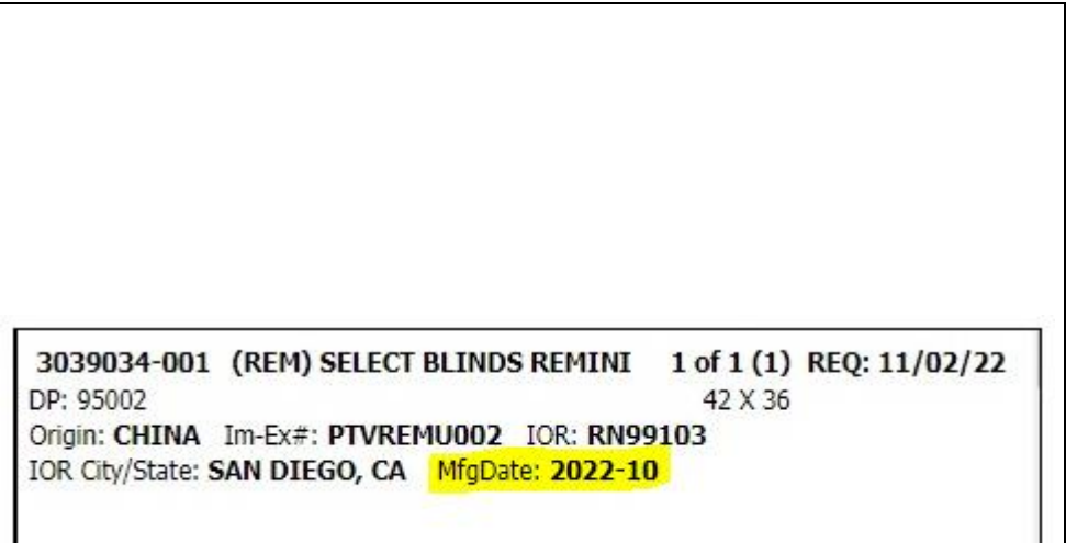
IMAGE 2. SHIPPING BOX LABEL