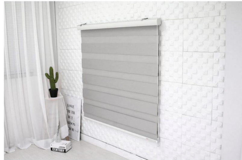
Hit blinds system is one of the most convenient and simple blind systems. our variety fabric colors can suit your taste.