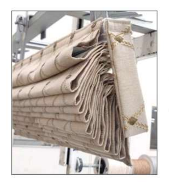
OBSOLETE RETURN DESIGN "DOG EARS"